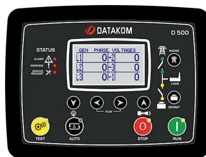
D-500LITE MK2 control operator / display panel