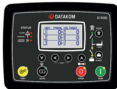
D-500LITE MK2 control operator / display panel