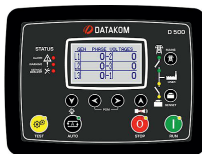
D-500LITE MK2 control operator / display panel